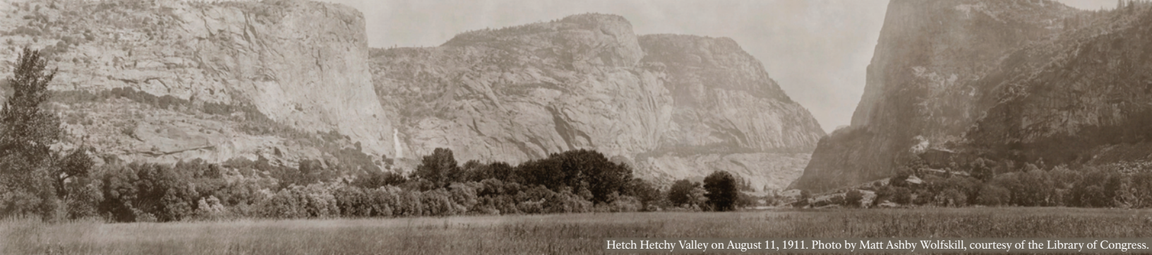
Hetch Hetchy Valley on August 11, 1911.