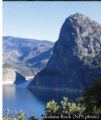
Kolana Rock

Hetch Hetchy's relatively low elevation provides for one of the longest hiking seasons in Yosemite, and the varied trails include something for everyone. Carry plenty of water and sunscreen and watch for rattlesnakes and poison oak. Overnight backpackers need a wilderness permit, which can be obtained at the Hetch Hetchy Entrance Station at no cost. Bear canisters are required for backcountry food storage for overnight hikers.