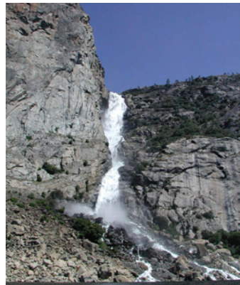
Wapama Falls