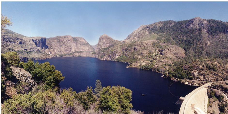
The eight mile long Hetch Hetchy Reservoir and O'Shaughnessy Dam as seen today

Dam supporters were convinced that a reservoir could offer tremendous social and economic benefits. The fastest growing city in the West, San Francisco was facing a chronic water and power shortage. In 1906, an earthquake and fire devastated San Francisco, adding urgency and public sympathy to the search for an adequate water supply. Congress passed the Raker Act in 1913, authorizing the construction of a dam in Hetch Hetchy Valley as well as another dam at Lake Eleanor.